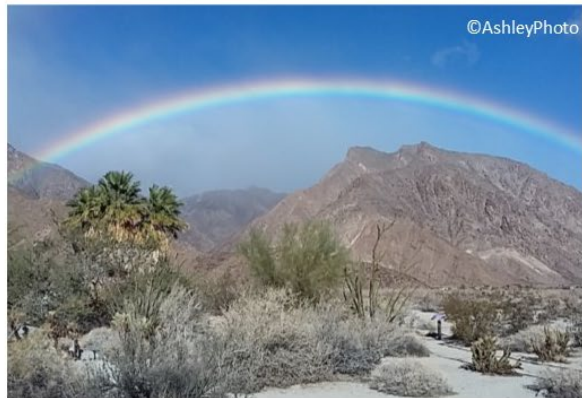
This is NOT OKAY! ↑ (identifying signature)