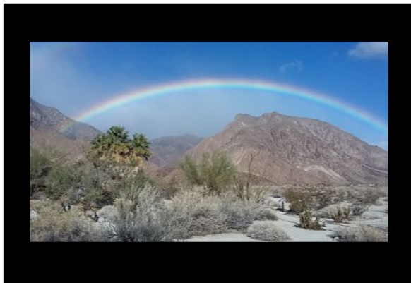
This is NOT OKAY! ↑ (black foam core)