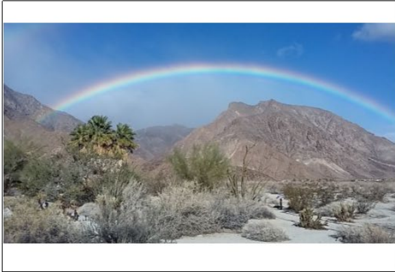
This is good! ↑