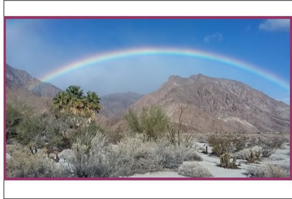
This is NOT OKAY! ↑ (border around photo)