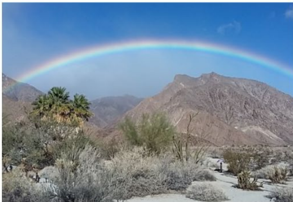
This is good! ↑