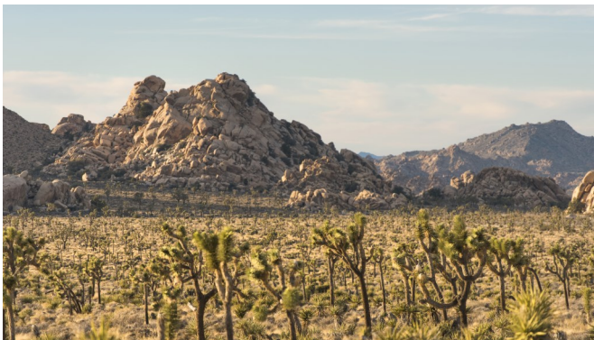
Joshua trees and rocky hills in Joshua Tree National Park.

The Mojave and Colorado Deserts Biosphere Region is one of 28 Biosphere Regions in the United States, and 748 around the world in 134 countries. The MCDDBR is a member of the United States Biosphere Network, which fosters national and international connections among biosphere regions, facilitates the sharing of best practices, and supports the work of individual biosphere regions. We are also a part of the World Network of Biosphere Reserves. Connecting with other BRs in the U.S. and around the world allows us to share knowledge and ideas and receive technical support for local and regional action.