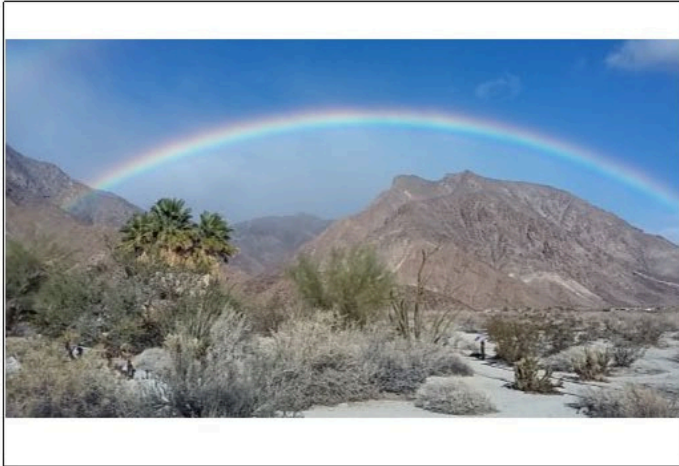
This is good! ↑

Examples of Correct and Incorrect Mounting Methods: