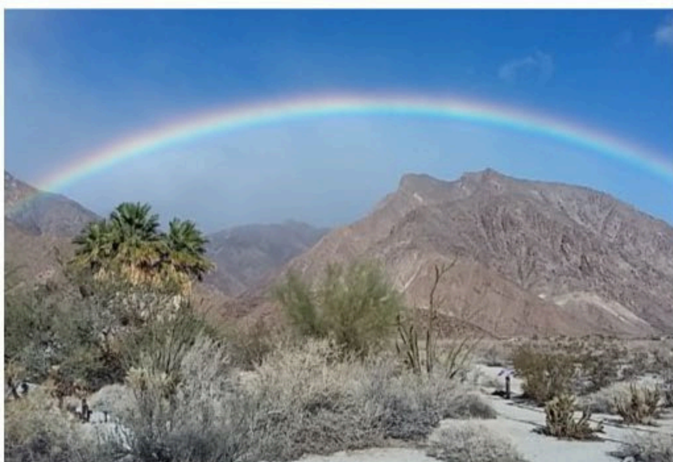
This is good! ↑