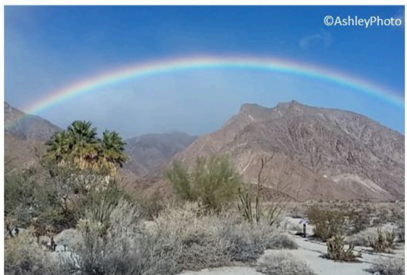
This is NOT OKAY! ↑ (identifying signature)