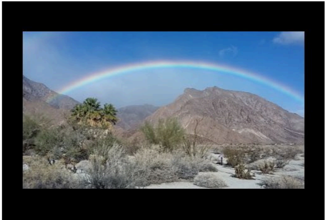
This is NOT OKAY! ↑ (black foam core)